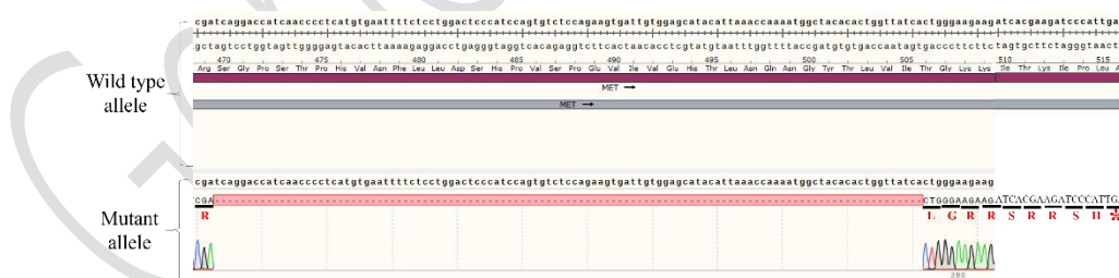
Figure 2 | The Sanger sequencing of the H_cMET KO HEK-293 Cell Line showed successful knockout of cMET.